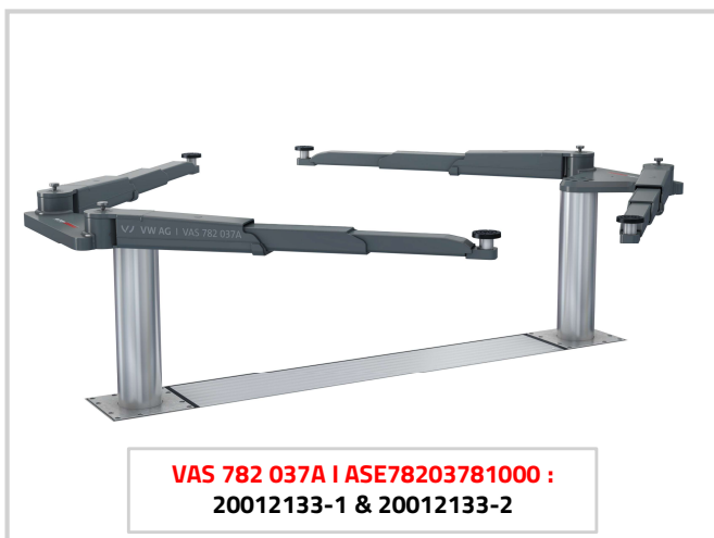
VAS 782 037A | ASE78203781000 : 20012133-1 & 20012133-2

Electro-hydraulic twin-ram lift 5.5 t with swivel arm superstructure