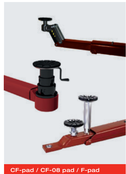
CF-pad / CF-08 pad / F-pad