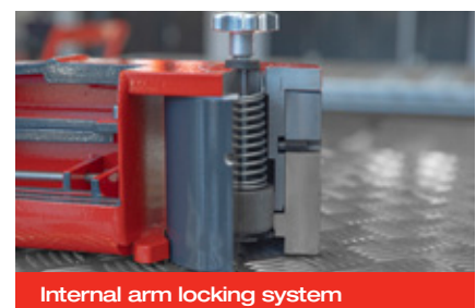
Internal arm locking system