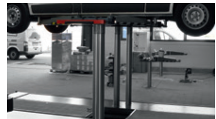
Sturdy lift with Saav free-wheel lift