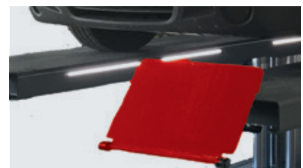
LED lighting set