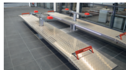
Lift in reception area