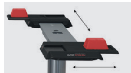
XY-heads with rubber