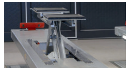
Integrated free-wheel lift