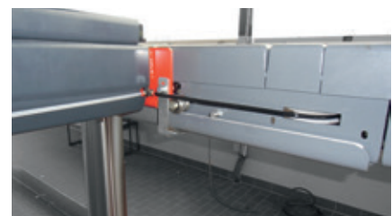
Air supply for scissor jack