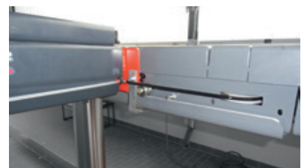
Air supply for scissor jack