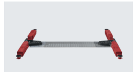
Superstructure on floor