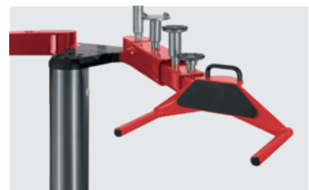
Superstructure with lifting pads and wheel adaptors