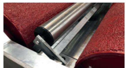
Sensory rollers of stainless steel