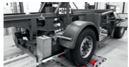
Testmaster RT 130-2