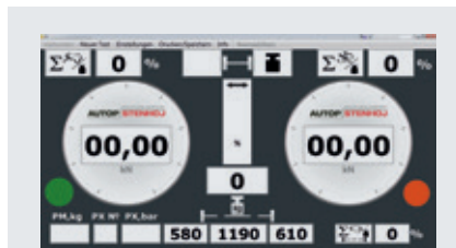
Basic software display