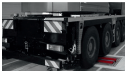
Roller width 1,500 mm