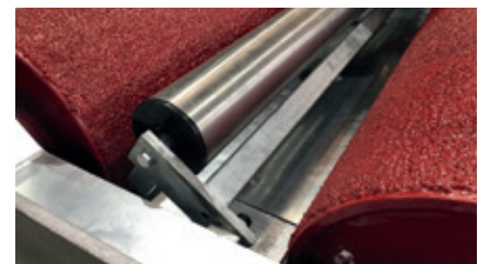
Sensory rollers of stainless steel