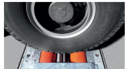
Reinforced roller set