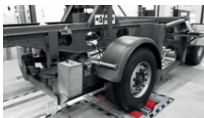
Testmaster RT 187-2