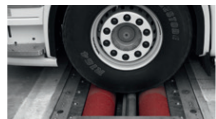
Testmaster RT 187-2