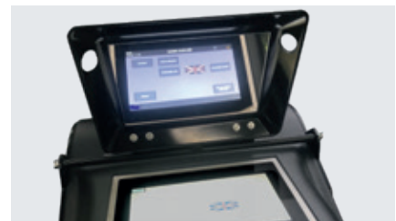
Display cover with mirror