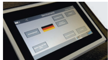
Touch Display 7"