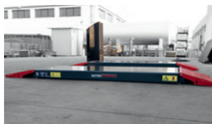
Special flat design ≤ 100 mm