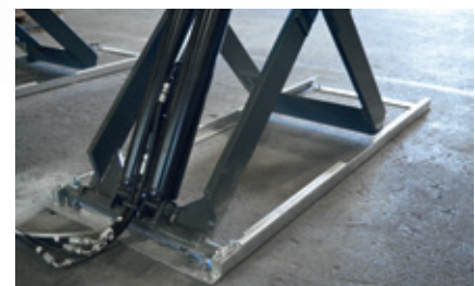
Base frame galvanized as standard