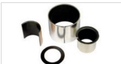
Lubrication free teflon sliding bearings in all joints