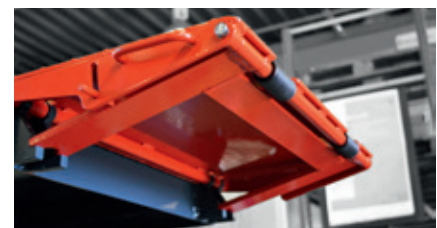
Stable ramps made of tear plate, for a better drive-on situation, even in damp conditions