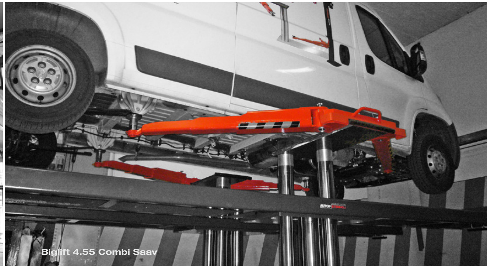
Biglift 4.55 Combi Saav