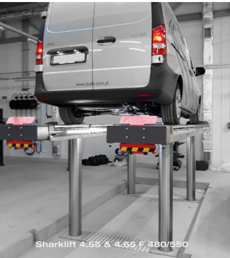
Sharklift 4.55 & 4.65 F 480/550