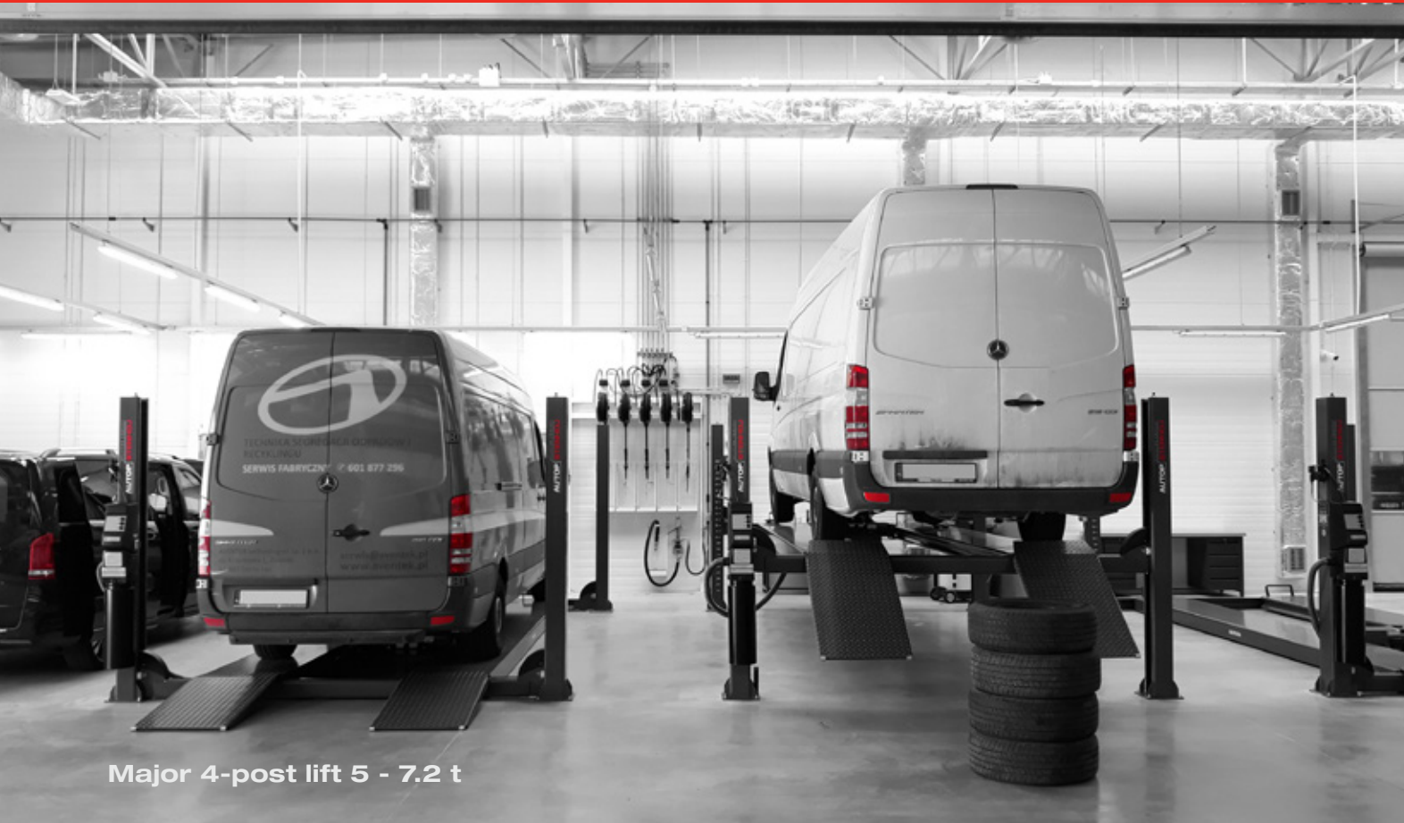
Major 4-post lift 5 - 7.2 t