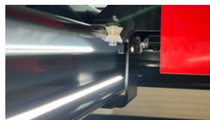
Roller suspensions for scissor jack on the inside of the platform profile