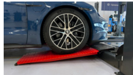
Long ramps available for low vehicles (optional)