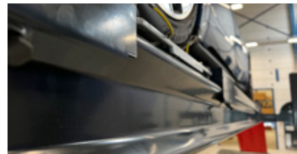
Bended profile for high platform stability